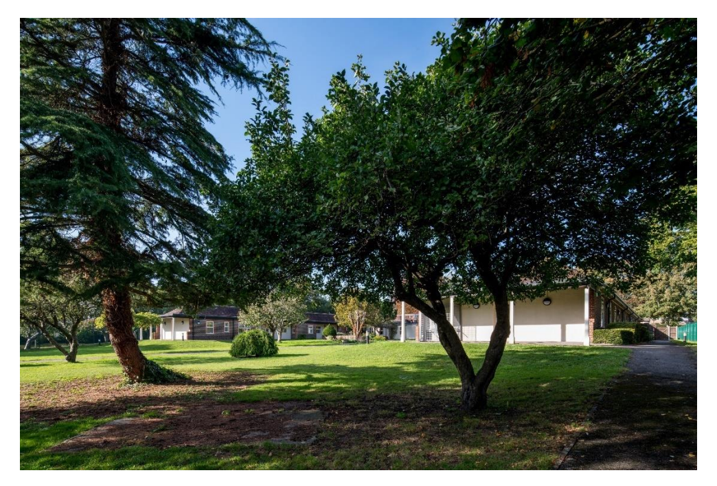
Outdoor space at rear available for staff wellbeing and service user activities