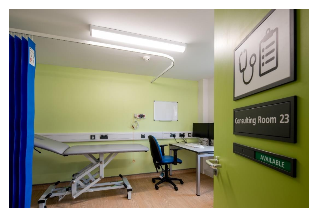
A consulting room